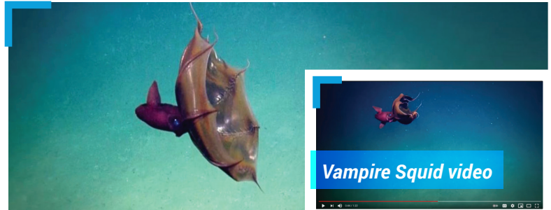
A vampire squid captivated researchers during the ECOGIG cruise.

Not much is known about the behavior of this mysterious creature, but they've gained a bit of a following in pop culture. Recently they picked up the ultimate honor for an animal: immortality as a Pokémon character.