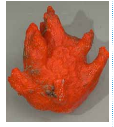
The sponge Forcepia is the source of the lasonolides. The Deep-Sea Medicines 2003 Expedition collected specimens to continue work on the development of lasonolides as new treatments for cancer.

Lasonolide – Extracted from the sponge Forcepia sp.; anti-tumor agent; acts by binding with DNA