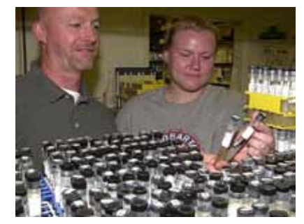
Harbor Branch Oceanographic Institution has more than 16,000 cultures of microbes isolated from deep- and shallowwater marine organisms. Image courtesy NOAA OE. http://oceanexplorer.noaa.gov/explorations/03bio/ background/microbiology/media/figure_01.html

http://oceanexplorer.noaa.gov/explorations/03bio/ background/microbiology/media/figure_04.html