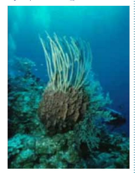
Competition for resources is intense in habitats such as reefs. Many of the sessile invertebrates produce natural products to help them be more competitive.