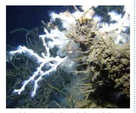
Lophelia pertusa coral, with opened polyps, attached to an authigenic carbonate rock. Seep-dependent tubeworms are visible behind the coral.

one in six Americans have some form of arthritis, and hospitalized patients are increasingly threatened by infections that are resistant to conventional antibiotics. The cost of these diseases is staggering: $285 billion per year for cardiovascular disease; $107 billion per year for cancer; $65 billion per year for arthritis. Death rates, costs of treatment and lost productivity, and emergence of drugresistant diseases all point to the need for new and more effective treatments.