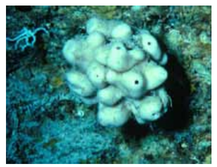
The deep-water sponge Discodermia is now in clinical trials for the treatment of cancer. Image courtesy NOAA OE. http://oceanexplorer.noaa.gov/explorations/03bio/ background/plan/media/discodermia.html