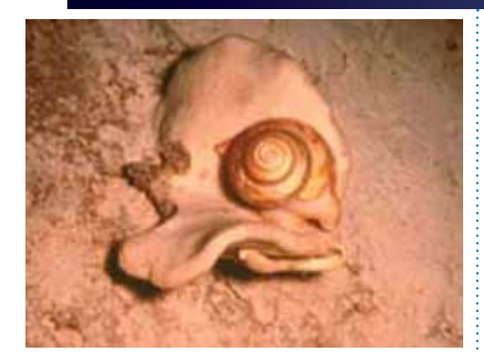
Organisms such as the slit shell mollusk, which is feeding on a lithistid sponge, produce chemicals to defend themselves against predation. Some such animals "stockpile" the compounds found in their diets.

Lessons from the Deep: Exploring the Gulf of Mexico's Deep-Sea Ecosystems How Diverse is That? - Grades 9-12 (Life Science)