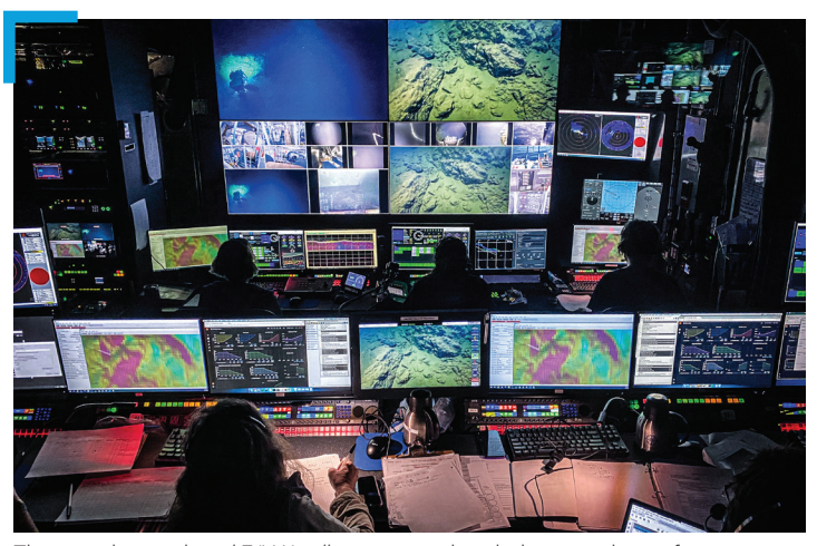
The control room aboard E/V Nautilus serves as the mission control room for undersea exploration.

A cluster of white, oblong octopus eggs was observed during the dive. If you look carefully, eye spots are visible on some of them. A newly hatched octopus is just above the red shrimp in the lower left corner.