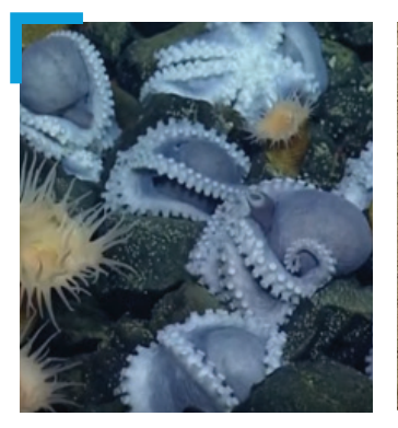
Female Muusoctopus robustus octopuses protect their eggs by positioning themselves with their arms wrapped upwards towards their heads.

Chad believes there are other locations along the California coast where octopuses gather at warm water seeps. The challenge, however, is finding them. "These seamounts are so deep and so complex," Chad says. "In such a harsh environment, it's going to take a lot of hard work to answer these questions."