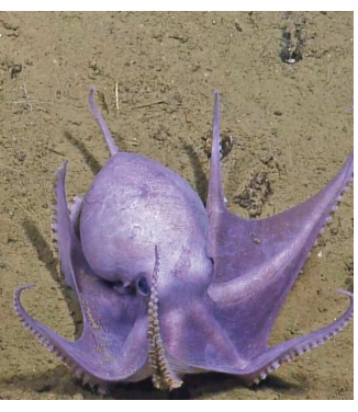
Our first octopus encounter on this expedition was with a Muusoctopus robustus with its arms outstretched.