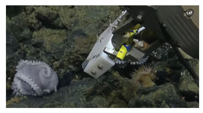
ROV Hercules takes a temperature reading with its mechanical arm of shimmering, warm water near a brooding octopus.