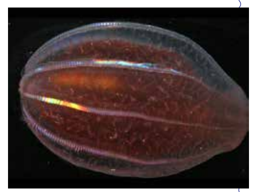
The ctenophore, Beroe cucumis , is specialized to eat other ctenophores.