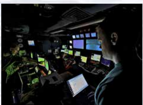
A spectacular photo of the NOAA Ship Okeanos Explorer Control Room while ROV operations are underway.