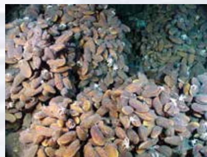
At NW Eifuku volcano, mussels are so dense in some places that they obscure the bottom. The mussels are ~18 cm (7 in) long. The white galatheid crabs are ~6 cm (2.5 in) long. Image credit: NOAA. http://oceanexplorer.noaa.gov/explorations/04fire/logs/birez/mussel_mound_birez.jpg