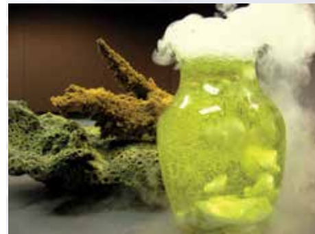
Dry ice, a pH indicator, and water can be used in the classroom to demonstrate the acidifying effects of carbon dioxide in ocean water. For a similar demonstration using human respiration instead of dry ice, see page 41.