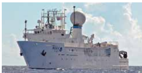
NOAA Ship Okeanos Explorer : America's Ship for Ocean Exploration. For more information, see the following Web site: http://oceanexplorer.noaa.gov/okeanos/welcome.html