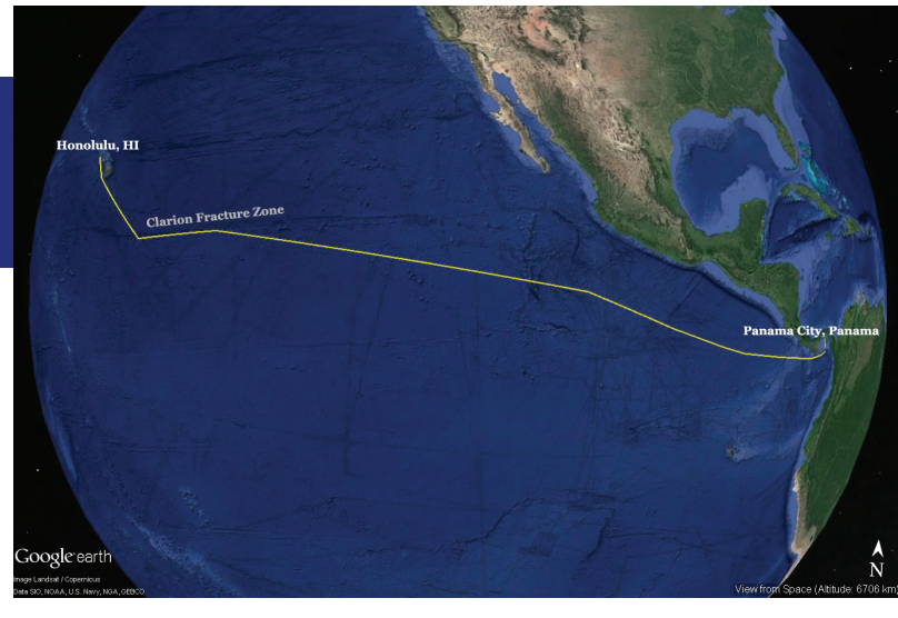
Map showing the approximate planned transit path for the Okeanos Explorer from Honolulu, Hawaii, to Panama City, Panama (yellow line).

October 16 - November 11, 2017: Telepresence mapping and CTD rosette casts starting in Honolulu, Hawaii, and ending in Panama City, Panama.