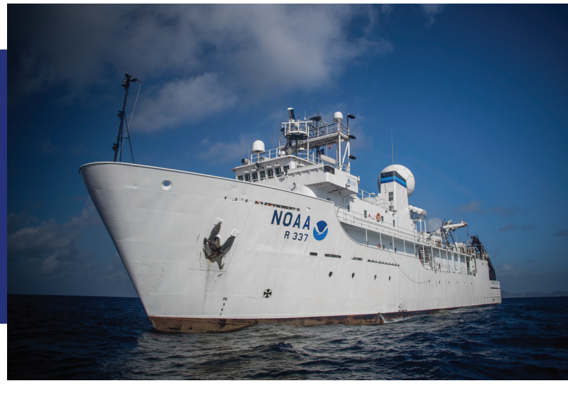
NOAA Ship Okeanos Explorer at sea.