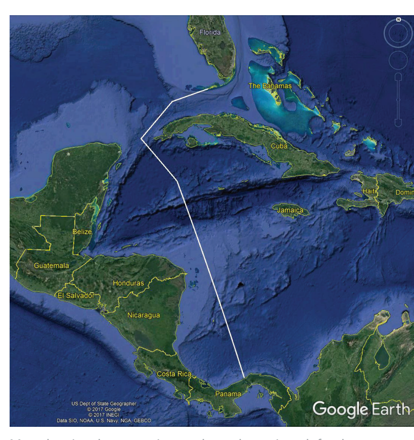
Map showing the approximate planned transit path for the Okeanos Explorer from Panama to Florida (white line).

November 15 - 22, 2017: Mapping starting in Panama City, Panama, and ending in Key West, Florida.