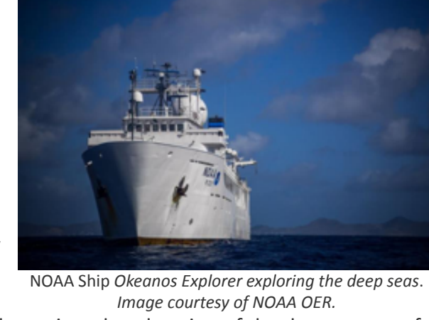
The Okeanos Explorer rings in the New Year with continued exploration of the deep waters of the U.S. Gulf of Mexico and a return to the Atlantic Ocean. In 2018, a multidisciplinary team of

The NOAA Ship Okeanos Explorer pulled into