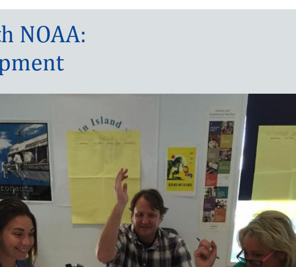
Educators use learning shapes to play a game called To Boldly Go during a professional development workshop.