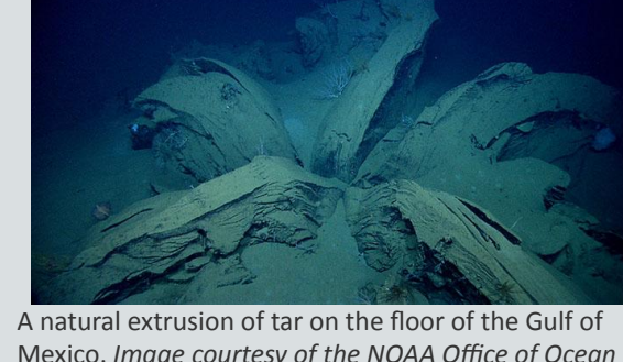
Mexico. Image courtesy of the NOAA Office of Ocean Exploration and Research, Gulf of Mexico 2014.