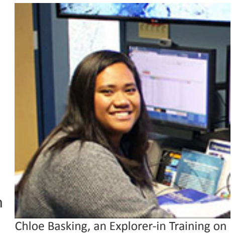
the NOAA Ship Okeanos Explorer.

The University Corporation for Atmospheric Research (UCAR) places mapping trainees into the NOAA Ship Okeanos Explorer -in-Training program. This program is open to enrolled undergraduate and graduate students as well as individuals who have recently graduated from a higher education program. The Explorer-in-Training program will provide the opportunity to gain experience using an advanced multibeam bathymetric sonar mapping system, while contributing in a significant way to the Okeanos Explorer ocean exploration mission.