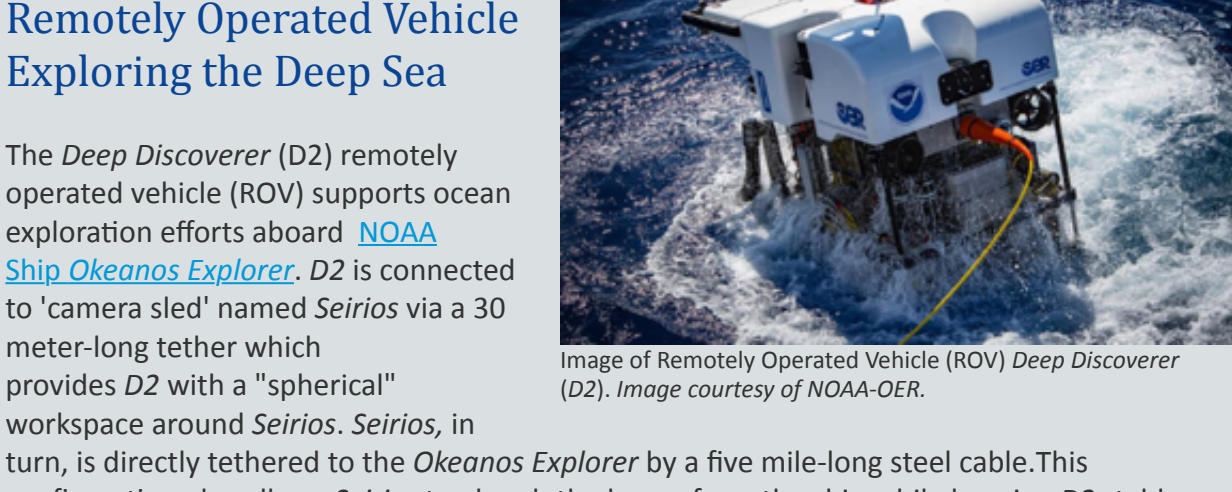
it explores the ocean floor. It is this tandem robot configuration that allows stunning imagery

informs current and future management decisions.