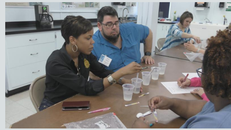
Teachers measuring water pH and temperature during the Exploring the Deep Ocean with NOAA Professional Development workshop for educators at the Dauphin Island Sea Lab in Alabama in March 2017.

If you want to learn about why and how we explore the deep ocean, please attend one of our free educator professional development workshops at an aquarium or science center near you!