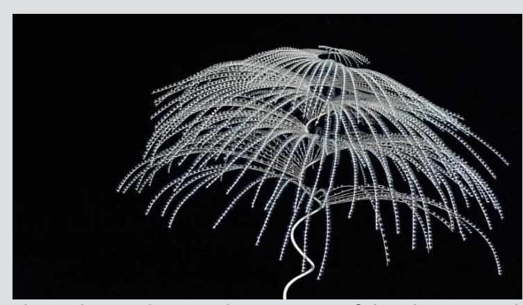
The curly-cue shape is characteristic of this chrysogorgid octocoral, called Iridogorgia.

During the Mountains in the Deep: Exploring the Central Pacific Basin Expedition from April 27 through May 19, 2017, the NOAA Ship Okeanos Explorer will investigate unknown and poorly known deep water areas in the Kingman Reef and Palmyra Atoll, and Jarvis Island Units of the Pacific Remote Islands Marine National Monument, around the Cook Islands Marine Park, and the high seas. The remotely operated vehicle, Deep