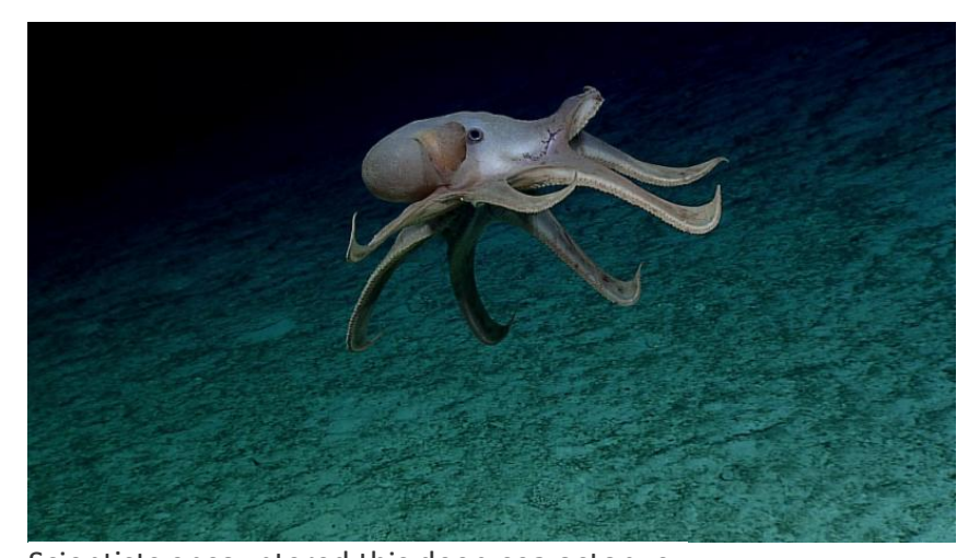
Scientists encountered this deep-sea octopus.

This dumbo octopus uses its fins on either side of its head to gracefully propel itself through the water column. Watch this video to see how the