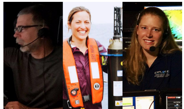
Explorers on board NOAA Ship Okeanos Explorer.