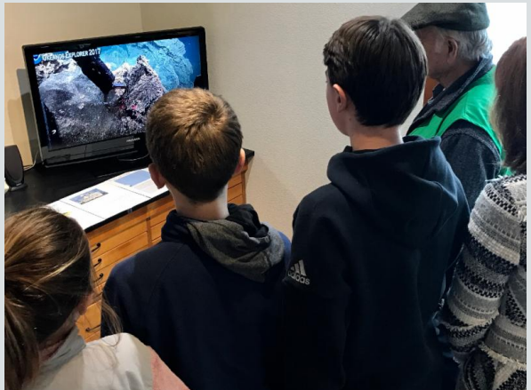
A group of children watch the Okeanos Explorer live feed on February 27, 2017 during their visit to the Charleston Marine Life Center in Oregon.

(for <u>iOS</u> or <u>Android</u> devices) that will allow you to bring the excitement of ocean discovery directly to your smart phone or tablet. Visit our <u>website</u> to see exciting discoveries we have made thus far this year. An overview of the entire 2017 field season can be found <u>here</u>.