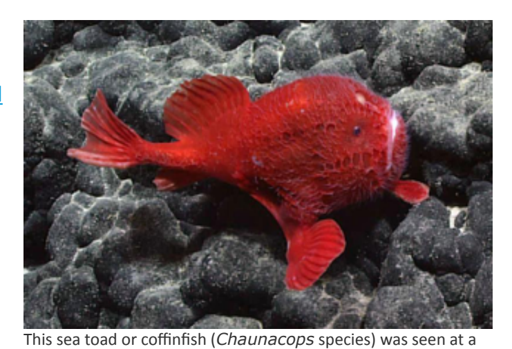
Seamount group northeast of O'ahu, Hawaiian Islands. are among the more unusual fish occasionally observed during the NOAA Ship Okeanos Explorer's ROV expeditions in the central Pacific Ocean. They are deepwater relatives of

depth of about 3,148 meters (1.96 miles) in the Musicians