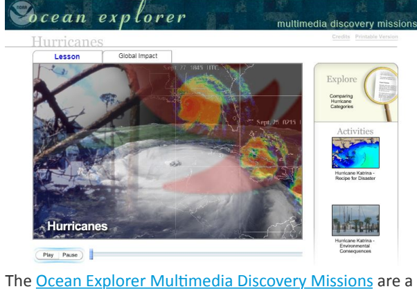
series of 13 interactive multimedia presentations and learning activities that address a wide range of ocean topics.