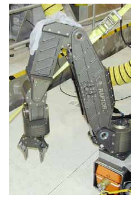
The robotic arm for the ROV Tiburon has to be both powerful and dextrous to collect many different sample types.

The third type of robotic arm is the cylindrical configuration. These arms have a rotating base, and two prismatic joints that give the arm up/down and in/out movements; sort of like a forklift on a lazy susan. The work envelope of these arms is (you guessed it!) shaped like the inside of a cylinder.