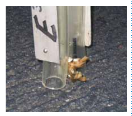
The ROV crew designed and tested a new claw design, with a scissor-like edge and a flexible grip.

Lessons from the Deep: Exploring the Gulf of Mexico's Deep-Sea Ecosystems Call to Arms – Grades 5-6 (Life Science/Physical Science)