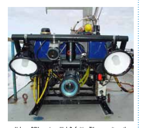
Hela, an ROV carrying a High Definition TV camera sits on the stern of the RV Connecticut . http://oceanexplorer.noaa.gov/explorations/03portland/logs/ sept15/media/helaisis.html

Lessons from the Deep: Exploring the Gulf of Mexico's Deep-Sea Ecosystems Call to Arms – Grades 5-6 (Life Science/Physical Science)