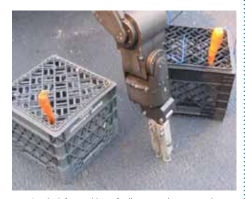
A makeshift assemblage of milk crates and carrots simulates a seabed for testing the new claw.

The Cartesian configuration is the fourth type of robotic arm, and consists of three prismatic joints arranged at right angles to each other so that the arm can slide in x, y, and z directions. The work envelope of the Cartesian configuration is a rectangle that extends to one side of the arm assembly.