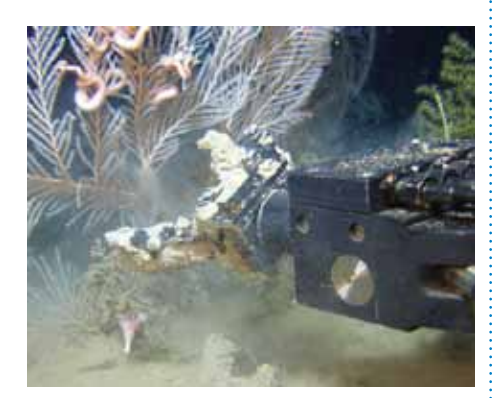
The ROV manipulator arm allows scientists to collect and bring samples to the surface for closer study.

Bacterial mats, mussels, and tubeworms are common at cold seeps. This image from Atwater Valley Site 340 in the Gulf of Mexico was captured with a downward-looking camera mounted on the deep submergence vehicle Alvin.