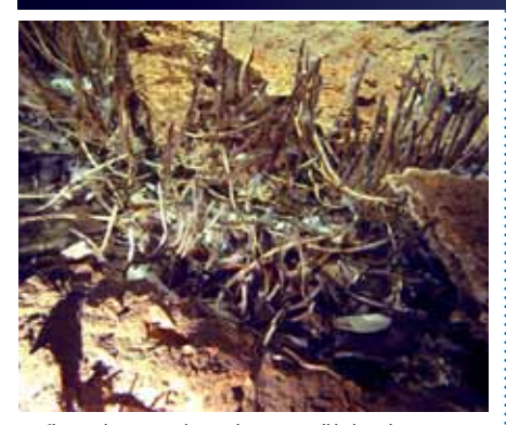
Chemical mapping during this cruise will help us better understand the role dissolved gases play in the distribution of chemosynthetic animals, such as these mussels and tubeworms.

Lessons from the Deep: Exploring the Gulf of Mexico's Deep-Sea Ecosystems What's in That Cake? – Grades 5-6 (Life Science)