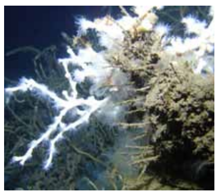
Lophelia pertusa coral, with opened polyps, attached to an authigenic carbonate rock. Seep-dependent tubeworms are visible behind the coral.