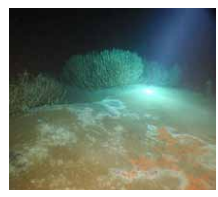
Large tubeworm aggregations composed of Lamellibrachia luymesi and Seepiophila jonesi from 530 m depth at a seep site on the Upper Louisiana Slope of the Gulf of Mexico. In the foreground are mats of sulfide-oxidizing bacteria.

http://oceanexplorer.noaa.gov/explorations/10chile/ background/habitats/media/habitats2.html