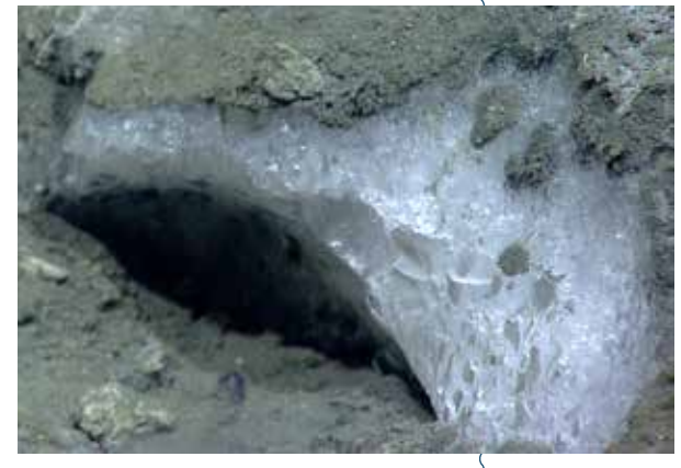
Close-up of methane hydrate observed at a depth of 1,055 meters, near where bubble plumes were detected in previous sonar data. Methane hydrates, a hydrate patch and chemosynthetic communities were seen during this dive, but no active seepage was observed.

Methane is produced in many environments by a group of Archaea that obtain energy by anaerobic metabolism through which they break down the organic material contained in once-living plants and animals. When this process takes place in deep ocean sediments, water molecules surround methane molecules, and conditions of low temperature and high pressure allow stable ice-like methane hydrates to form. Methane hydrate is a type of clathrate, a chemical substance