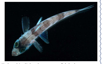
Under white light, the greeneye fish looks very different, but its green lenses are still apparent.