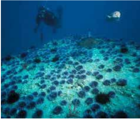
Sea urchins.

Aleutian Islands (Anthony, et al. , 2008). Surveys of bald eagles in 1993-1994 when sea otter populations were high were compared to surveys conducted in 2000-2002, when otter populations were extremely low. Researchers found that sea otter pups and fishes were an important part of eagles' diets in 1993-1994, but these species were much less significant in 2000-2002 and had been replaced by several species of birds. The explanation for this dietary shift is that sea otters are a "keystone species" in near-shore coastal environments (a keystone species is a species whose removal results in massive changes to species composition and other ecosystem attributes). Sea otters eat sea urchins, which can consume large quantities of kelp. Kelp forests provide habitat, shelter, and a buffer from waves and currents for numerous aquatic species. When sea otter populations were high, the otters controlled sea urchin numbers and ensured that the kelp could thrive. When sea otter populations declined (probably due to increased predation from orcas), the kelp-forest ecosystem began to collapse. Eventually, a deforested underwater landscape and lack of sea otter pups for food forced the bald eagles to change their diets. Similar interactions may occur in