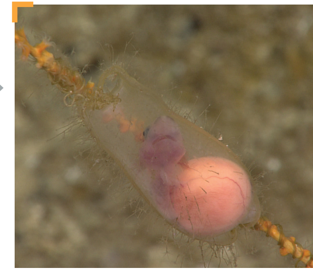
An embryonic catshark and egg case attached to an octocoral colony.