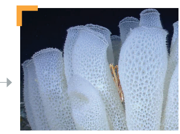
Can you spot the crustacean that is trapped in this species of Euplectella , photographed in the northwestern Gulf of Mexico? The common name of this glass sponge is the "Venus flower basket."