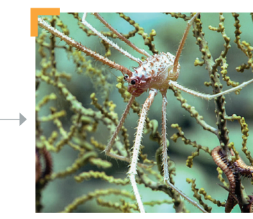
Specific species of squat lobsters and brittle stars are often associated with specific species of coral, like those seen perched on this gorgonian octocoral ( Paramuricea sp.).