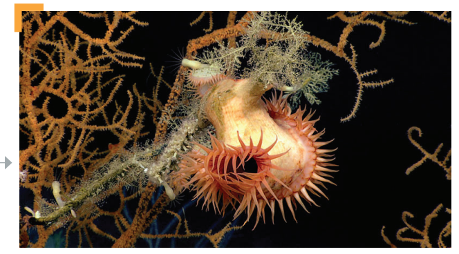
Flytrap anemone attached to a black coral.

A species that has a large contribution towards creating a habitat/ecosystem that support other species. This is similar to the way that certain types of trees create certain types of forest ecosystems.