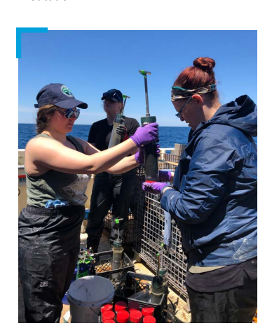
The science team holds a push core collected from Pamlico Canvon and places a rubber stopper in the bottom for safe storage before processing begins, Image courtesy of DEEP SEARCH 2019 - BOEM, USGS, NOAA.

Once all of the samples are off the ROV and appropriately stored, the real work begins-sorting and processing a basket as full as the one we collected from Pamlico Canyon can easily take another 24 hours! For more on this expedition check out the mission logs, including this log on what happens with samples when the team goes back to their lab.