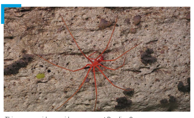
This pycnogonid sea spider was seen at Pamlico Canyon.