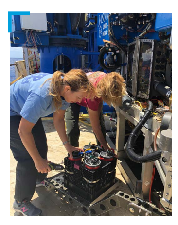
The science team removes coral quivers from the swing arm of ROV Jason. Coral quivers are containers designed to hold individual samples of coral.