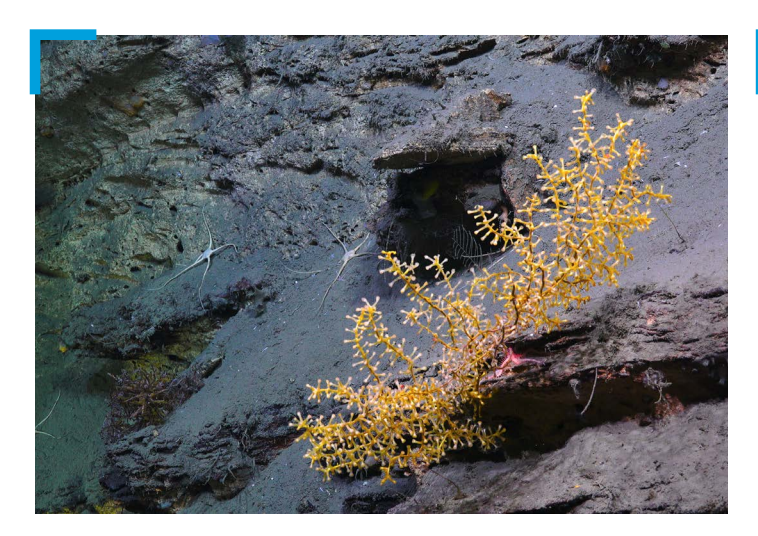
This Acanthogorgia coral was one of the target species at Pamlico Canyon.