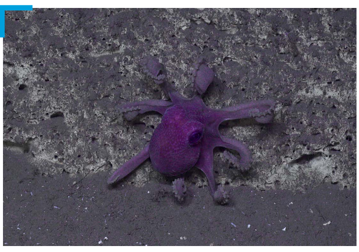
This octopus was seen at Pamlico Canyon.

crabs, spider crabs, squat lobsters, and sea spiders (class Pycnogonida). We were able to collect excellent samples of our target coral species (Acanthogorgia and Desmophyllum) as well as four sets of sediment core samples for further study. By the time we recovered the ROV at 4pm on Monday afternoon, the ROV's sample basket was completely full, and we knew we had a full night of work ahead of us!