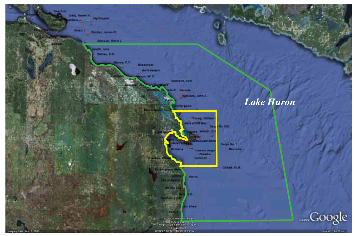
Figure 1. Existing (yellow) and proposed (green) boundaries of the Thunder Bay National Marine Sanctuary. Locations of some known shipwrecks are indicated.