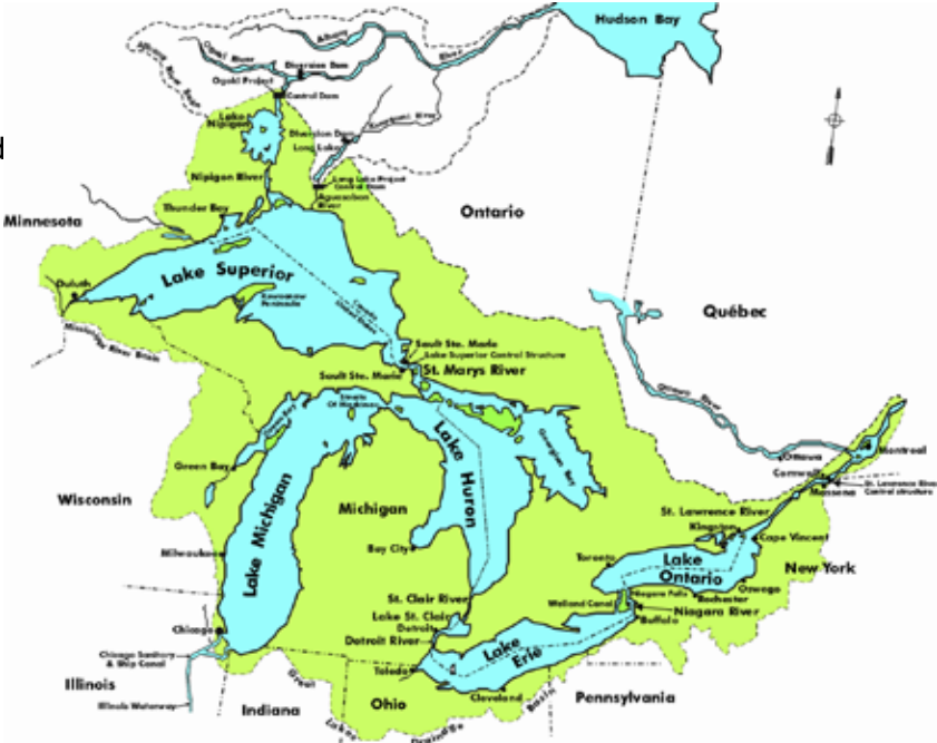
US Army Corps of Engineers, Detroit District. From Wikipedia.

Map 1. Great Lakes region, with Thunder Bay National Marine Sanctuary marked with a red dot.