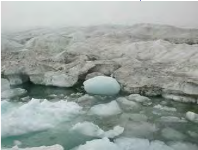
The ice in the Chukchi Sea sometimes resembled hills.

Biodiversity refers to the variety of living organisms in an ecosystem, and can be another important indicator of environmental change. At present, we know that there are at least three distinct biological communities (called “realms”) in the Arctic Ocean. The Sea-Ice Realm includes plants and animals that live on, in, and just under the ice that floats on the ocean’s surface. Sea ice is not usually solid like an ice cube, but is riddled with a network of tunnels called brine channels that range in size from microscopic (a few thousandths of a millimeter) to more than an inch in diameter. Diatoms and algae inhabit these channels and obtain energy from sunlight to produce biological material through photosynthesis. Bacteria, viruses, and fungi also inhabit the channels, and together with diatoms and algae provide an energy source (food) for flatworms, crustaceans, and other animals. This community of organisms is called sympagic, which means “ice-associated.” Partial melting of sea ice during the summer months produces ponds on the ice surface that contain their own communities of organisms. Melting ice also releases organisms and nutrients that interact with the ocean water below the ice.