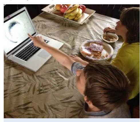
Telepresence technology allows anyone with Internet to follow an exploration...even over breakfast while on vacation. Image courtesy of NOAA Okeanos Explorer Program, Gulf of Mexico 2014 Expedition. http://oceanexplorer.noaa.gov/okeanos/explorations/ ex1402/logs/apr18_b/media/tartboys.html