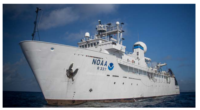
The NOAA Ship Okeanos Explorer, America's ship for ocean exploration.

and pitch to keep the antenna pointed toward the appropriate communications satellite. Radio transmitters and receivers connected to the VSAT antenna operate on "C -band" frequencies, which are in the microwave region of the electromagnetic spectrum.