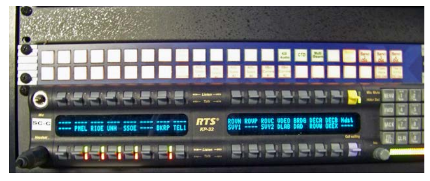
Exploring the Deep Ocean with NOAA

Telepresence streamlines other data management tasks with a custom suite of software and standard operating procedures that automatically collect raw and some processed data from all the different acquisition computers, and then move that data to a central server called the data warehouse. Then the system automatically moves all the data over the satellite connection to shore as bandwidth is available. Once the data are in the data warehouse, any member of the science team can access the data on an FTP site.