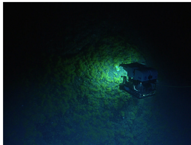
Remotely operated vehicle Deep Discoverer traverses over a field of live, yellow coral in the genus Eguchipsammia growing over the top of dead coral rubble seen during much of Dive 01 of the second Voyage to the Ridge 2022 expedition.